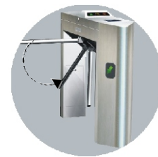
Railing off against power off