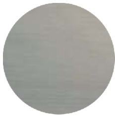
2mm SS304 stainless steel