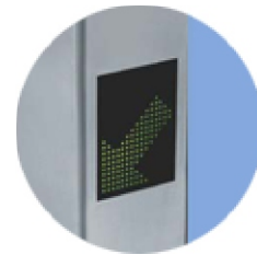
Equipped with passing indicator light, prompting the passing direction